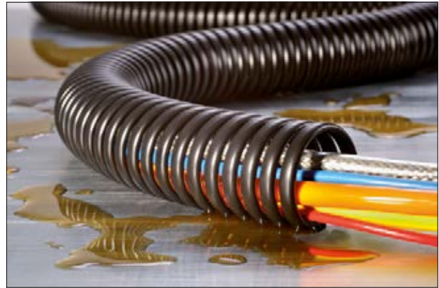
Spiral binding SPS is very robust and provides good protection against oil.