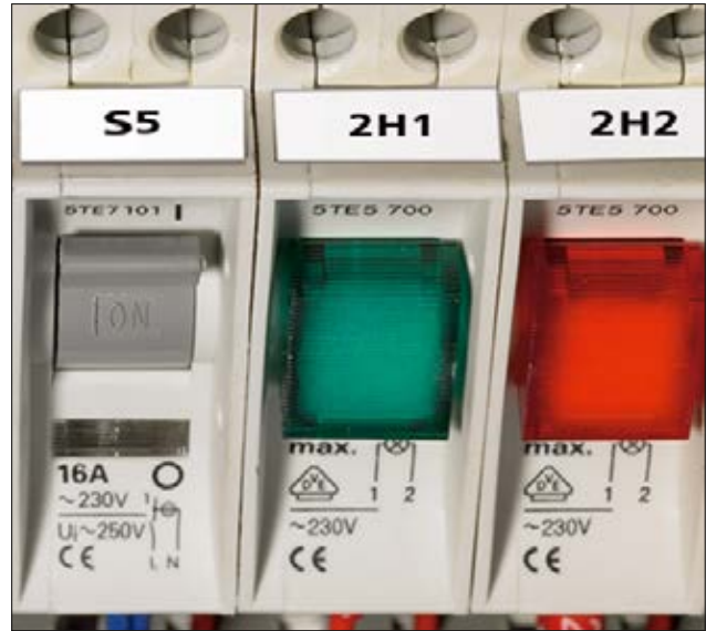
Clearly identified labels ensure easy network wire and cable management.