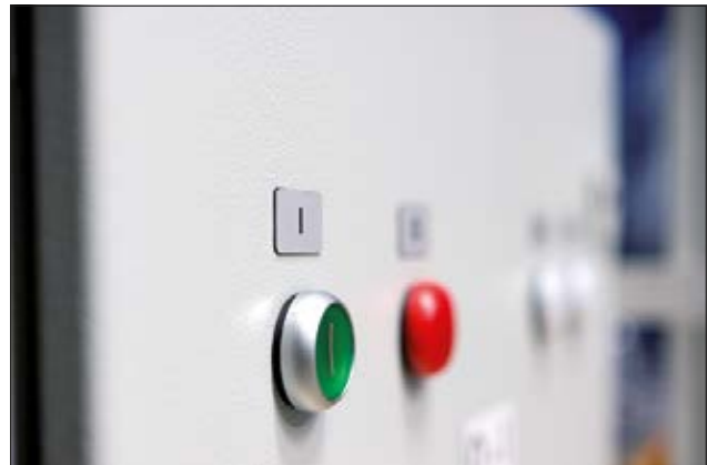
Panel labels are an ideal replacement for engraved plates.