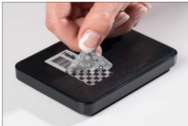
Highly visible tamper evidence.