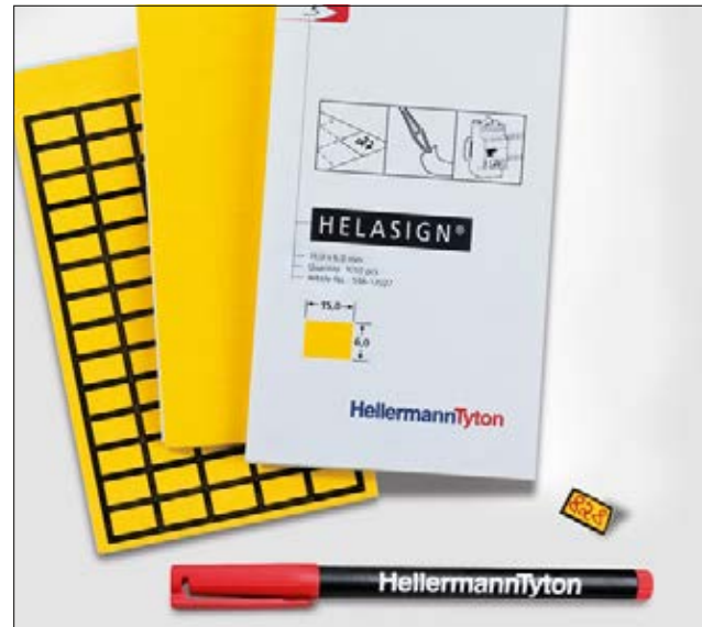
Always on hand: Labels in a convenient, pocket sized and lightweight booklet.