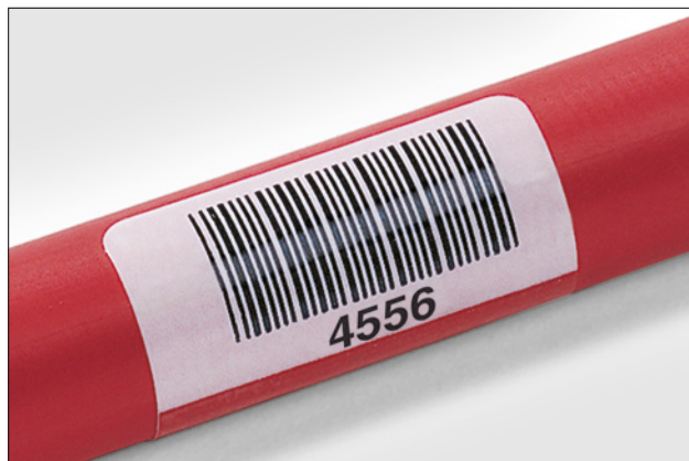
Laminating the mark gives long-term print survivability.