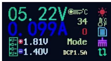
QuickCharge detection surface

By briefly pressing the button on the back of the unit, you can switch between the two surfaces.