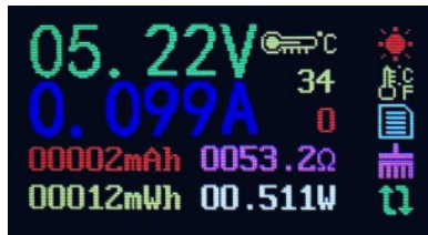
Main measuring surface