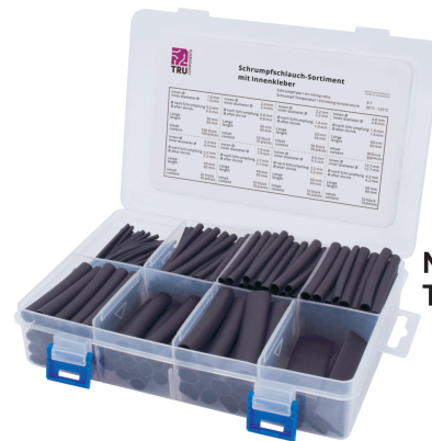
Nr. 1890124 Typ. T807CA006