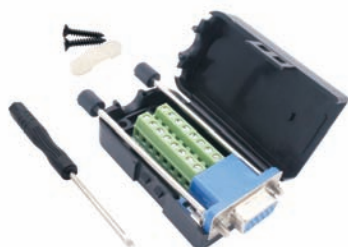
T1904C099 - Female connector with locking screw connection

Included accessories 1x Screw driver 1x Cable strain Relief 2x Fastening screw