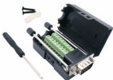
T1904C098 - Male connector with locking screw connection