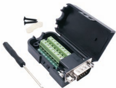
T1904C096 - Male connector with jackscrew nut connection