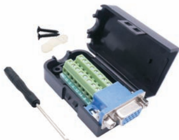
T1904C097 - Female connector with jackscrew nut connection