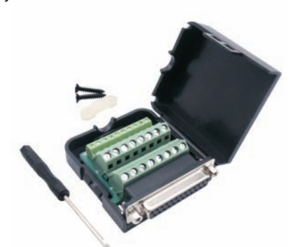
T1904C101 - Female connector with jackscrew nut connection