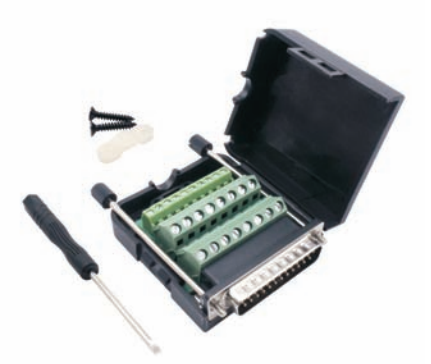
T1904C102 - Male connector with locking screw connection