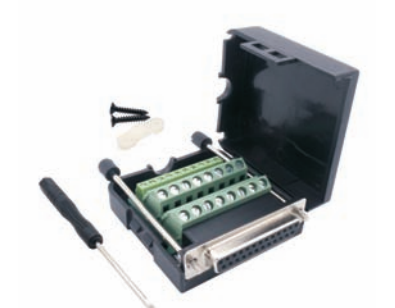
T1904C103 - Female connector with locking screw connection