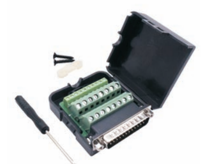
T1904C100 - Male connector with jackscrew nut connection