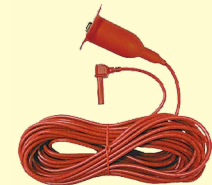
7253 Longer line probe with alligator clip(15m)