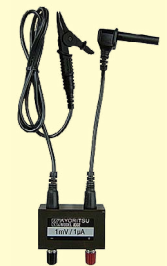
8302 Adapter for recorder (Output 1mV/1μA)