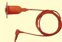
7168A Line probe with alligator clip(3m)