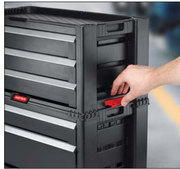
2. Safe and versatile stacking with snap-close connectors