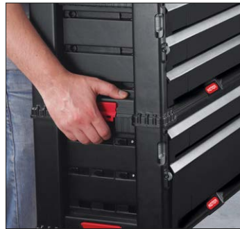
6. Integrated Carry handles