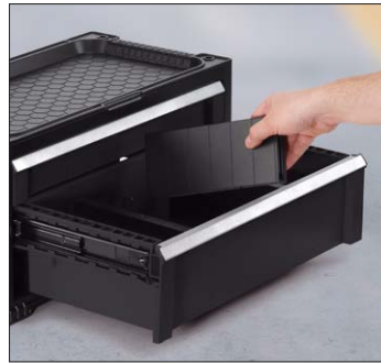
3. Removable dividers