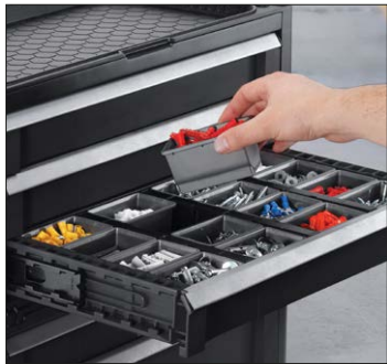
4. 16 removable small parts bins