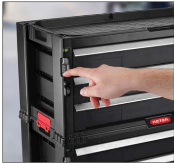
1. Central locking system prevents drawers shifting