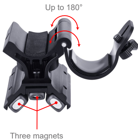
Up to 180°