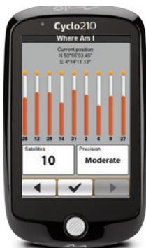
Where Am I Function