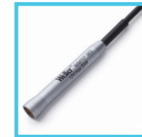
HANDLE TO PLUG IN DESOLDERING TIPS (WMP iron, WXMT iron)