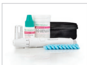
Starter set inclusive