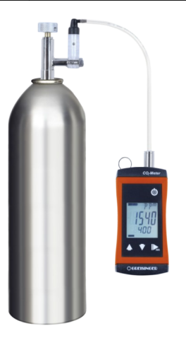
Calibration with test gas GZ-18 and adapter GZ-19