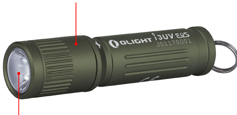
High Efficiency UV Led