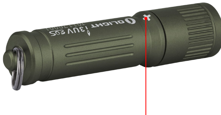
Positive Polarity Mark