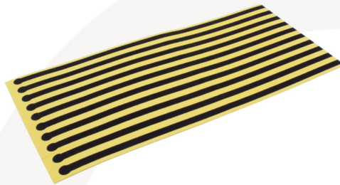
10 Strips per One sheet