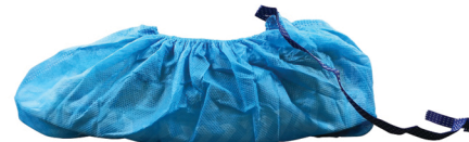
Conductive Shoe Covers