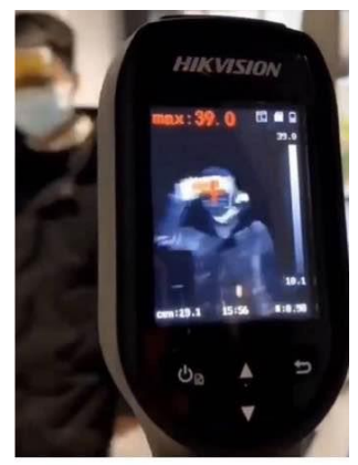
Normal Temp. Value: no Alarms