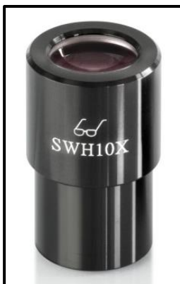
High Eye Point eyepiece (identified by the glasses symbol)