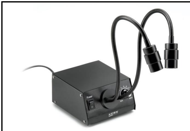
Typical goose neck lighting unit

The lighting units which are suitable for devices of the OZL-46 series, are goose neck lighting units ( see figure ). These are available as LED as well as halogen versions and also have an on/off switch or different controller.