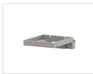
Mounting angle 200.002