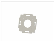
Mounting plate for wall box 200.001