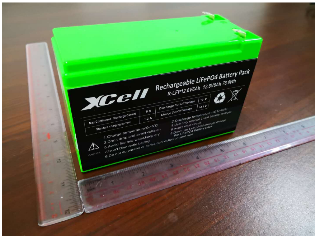
Figure 2 Overall view II of battery (电池图II)