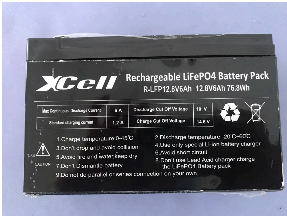
Figure 3 Battery Label