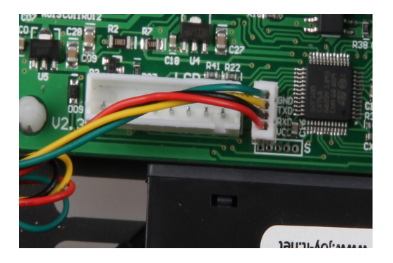
The module then must be plugged on to the mainboard.

The module is going to be screwed next to the small board from beneath the case.