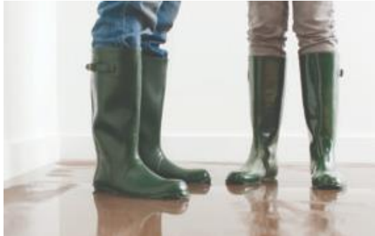
Prevent catastrophic flood