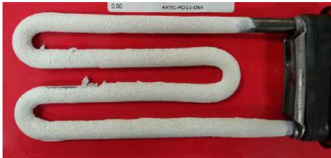
Low Efficiency: without limescale inhibitor