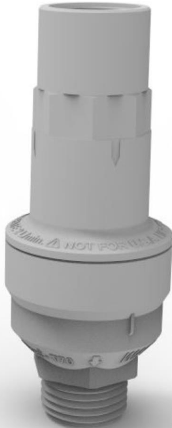
with Limescale inhibitor

Linked to market requirements, Eltek's R&D has developed a new solution, combining the safety function of water block with the limescale inhibitor function.