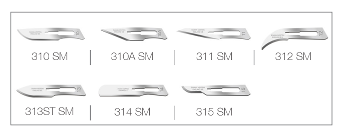
Small fitment blades For handles 3, 5A SM, 7 SM