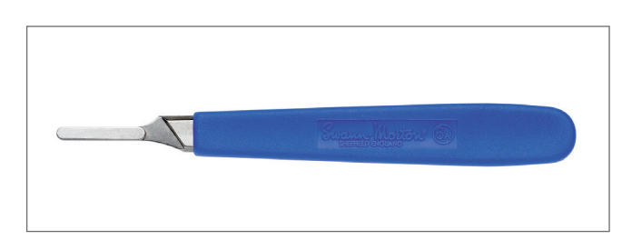
6A SM Handle only (acrylic handle)