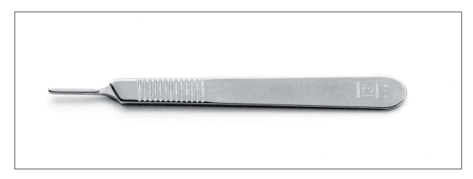
3 Handle only

Handles no. 3, 5A SM and 7 SM fit small fitment blades (310 SM, 310A SM, 311 SM, 312 SM, 313 SM, 314 SM, 315 SM).