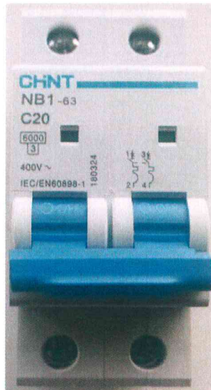
Images of NB1-63