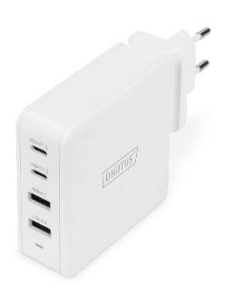
Quick Installation Guide DA-10197