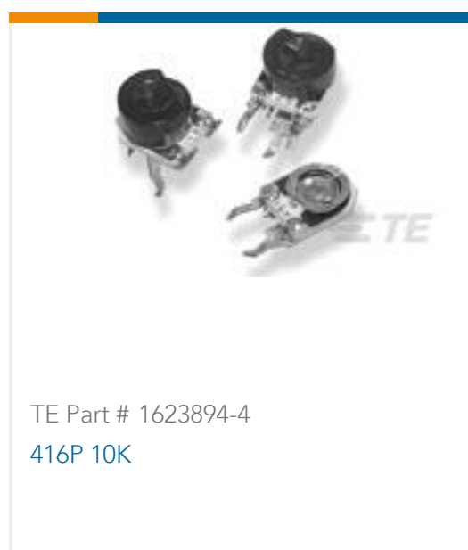
TE Part # 1623894-4 416P 10K