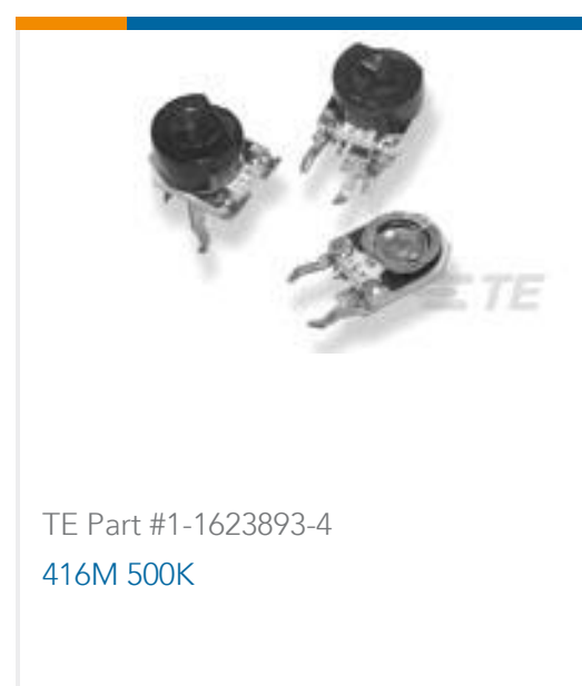
TE Part #1-1623893-4 416M 500K