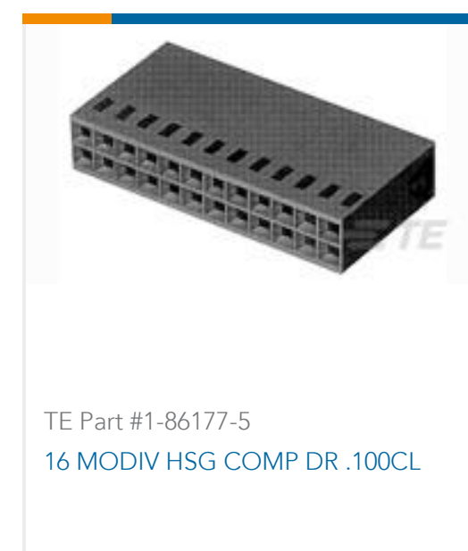
TE Part #1-86177-5 16 MODIV HSG COMP DR .100CL