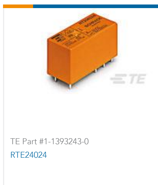
TE Part #1-1393243-0 RTE24024