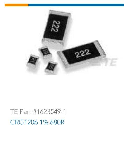
TE Part #1623549-1 CRG1206 1% 680R