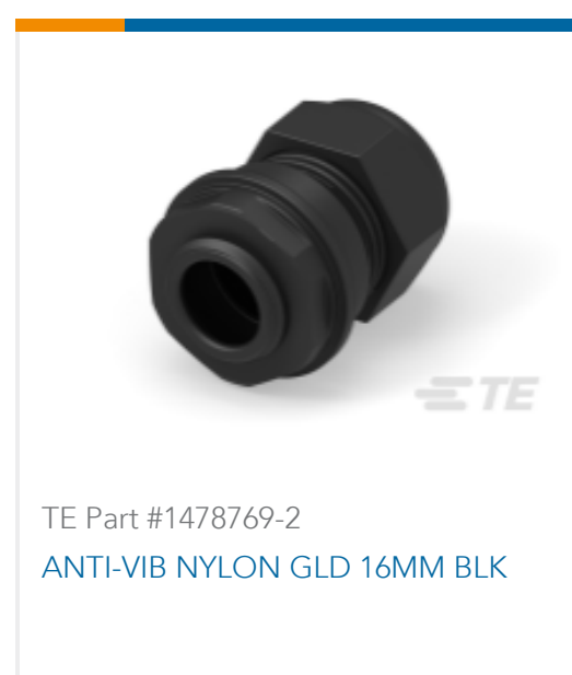
TE Part #1478769-2 ANTI-VIB NYLON GLD 16MM BLK