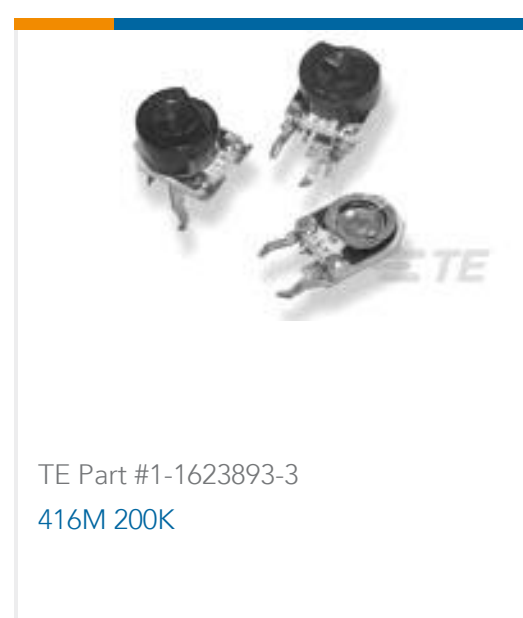
TE Part #1-1623893-3 416M 200K