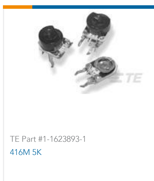
TE Part #1-1623893-1 416M 5K