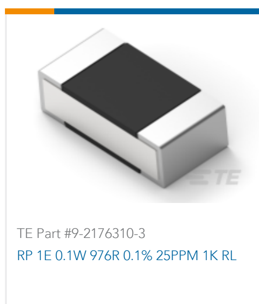
TE Part #9-2176310-3 RP 1E 0.1W 976R 0.1% 25PPM 1K RL