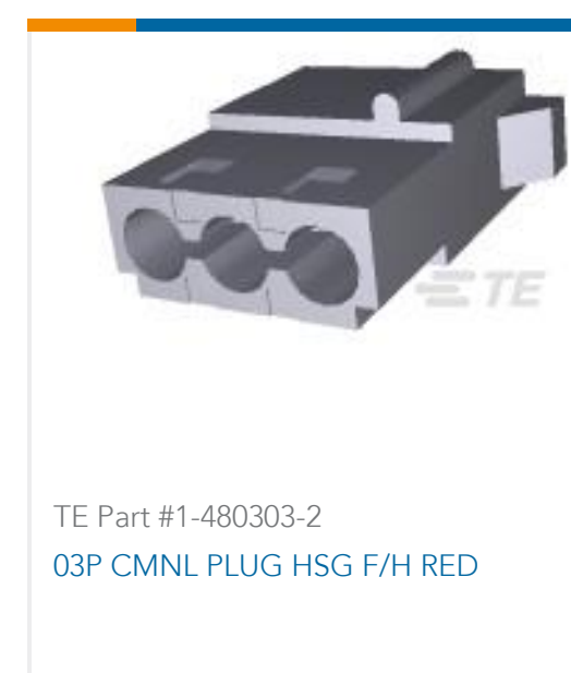
TE Part #1-480303-2 03P CMNL PLUG HSG F/H RED