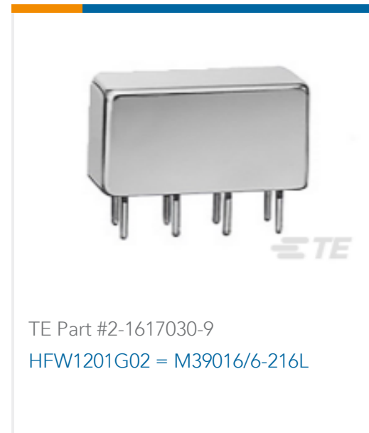
TE Part #2-1617030-9 HFW1201G02 = M39016/6-216L