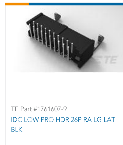
TE Part #1761607-9 IDC LOW PRO HDR 26P RA LG LAT BLK