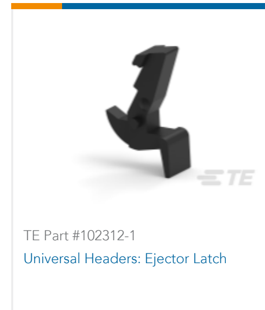
TE Part #102312-1 Universal Headers: Ejector Latch