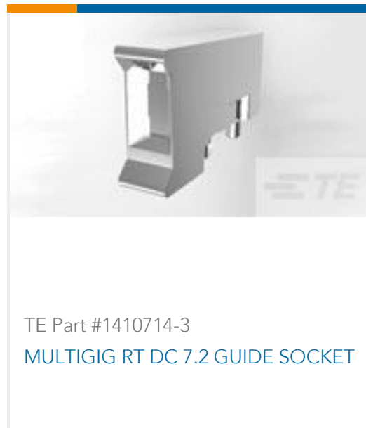
TE Part #1410714-3 MULTIGIG RT DC 7.2 GUIDE SOCKET