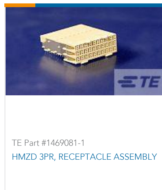
TE Part #1469081-1 HMZD 3PR, RECEPTACLE ASSEMBLY