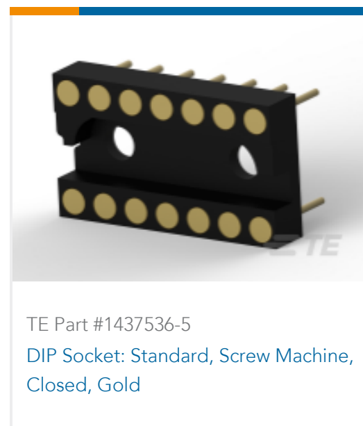
TE Part #1437536-5 DIP Socket: Standard, Screw Machine, Closed, Gold