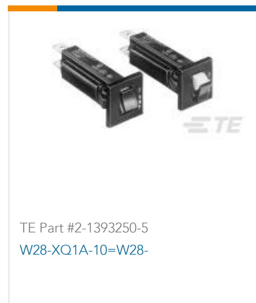
TE Part #2-1393250-5 W28-XQ1A-10=W28-