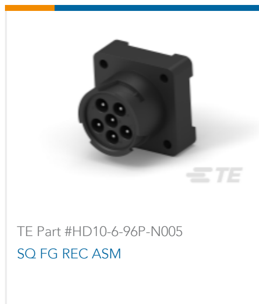
TE Part #HD10-6-96P-N005 SQ FG REC ASM