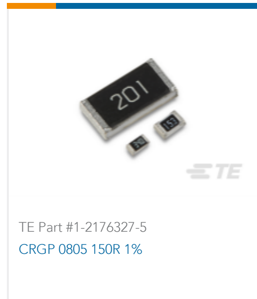
TE Part #1-2176327-5 CRGP 0805 150R 1%