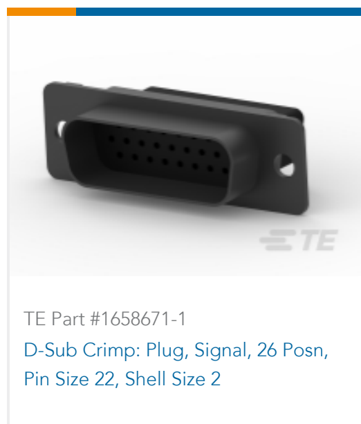
TE Part #1658671-1 D-Sub Crimp: Plug, Signal, 26 Posn, Pin Size 22, Shell Size 2