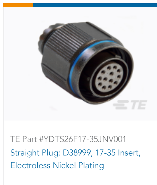
TE Part #YDTS26F17-35JNV001 Straight Plug: D38999, 17-35 Insert, Electroless Nickel Plating