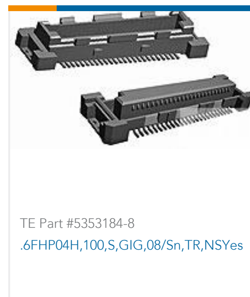
TE Part #5353184-8 .6FHP04H,100,S,GIG,08/Sn,TR,NSYes