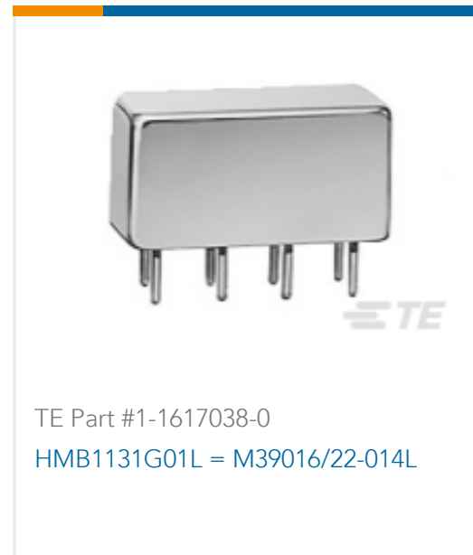
TE Part #1-1617038-0 HMB1131G01L = M39016/22-014L