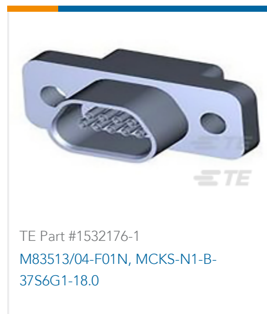
TE Part #1532176-1 M83513/04-F01N, MCKS-N1-B- 3756G1-18.0