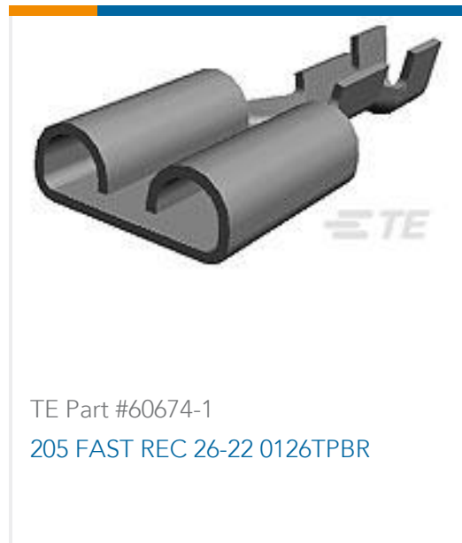
TE Part #60674-1 205 FAST REC 26-22 0126TPBR