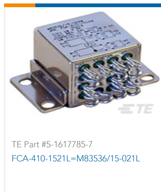
TE Part #5-1617785-7 FCA-410-1521L=M83536/15-021L