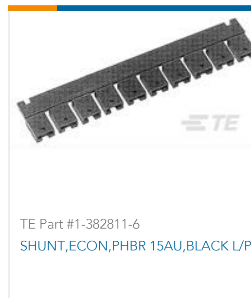
TE Part #1-382811-6 SHUNT,ECON,PHBR 15AU,BLACK L/P