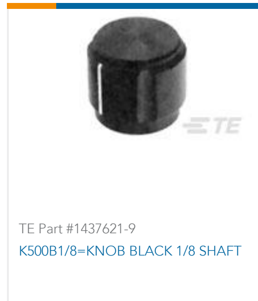
TE Part #1437621-9 K500B1/8=KNOB BLACK 1/8 SHAFT