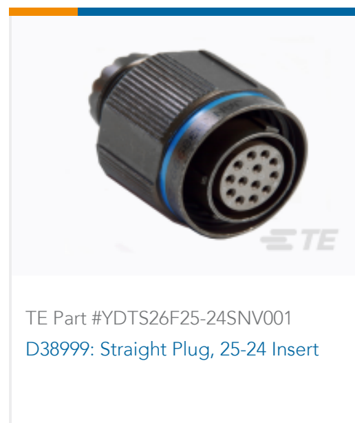
TE Part #YDTS26F25-24SNV001 D38999: Straight Plug, 25-24 Insert