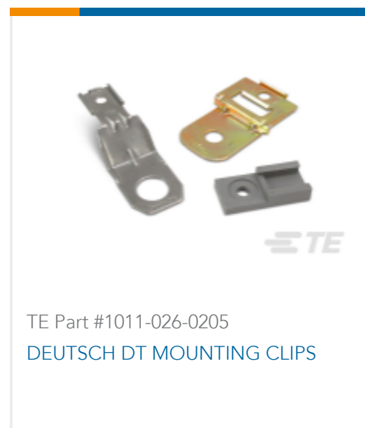
TE Part #1011-026-0205 DEUTSCH DT MOUNTING CLIPS