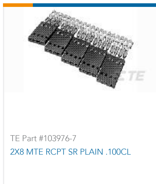
TE Part #103976-7 2X8 MTE RCPT SR PLAIN .100CL