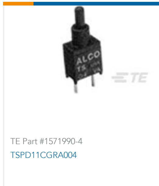
TE Part #1571990-4 TSPD11CGRA004