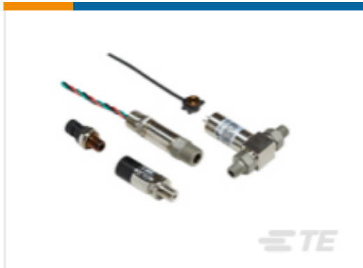
TE Part #M3021-000005-250PG Pressure Transducers Readily Available