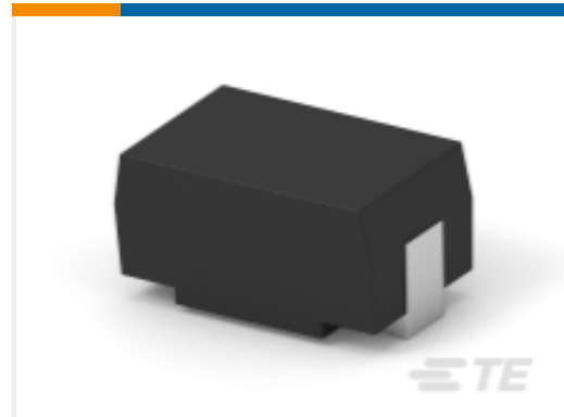
TE Part #1879234-4 SMD Power Resistor: 7 Watt, 200-2M Ohm