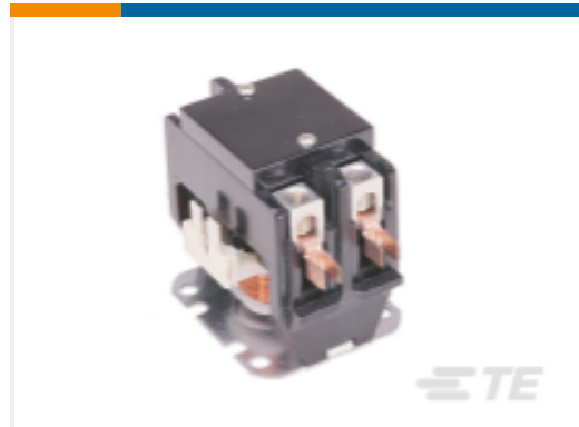
TE Part #1611004-6 DP CONTACTORS, 2 POLE