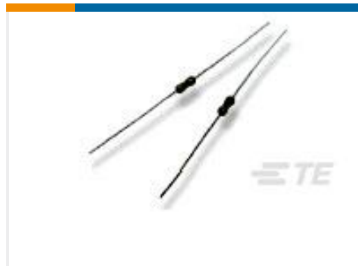
TE Part #2-1623708-3 RGP0207CH 5% 130M