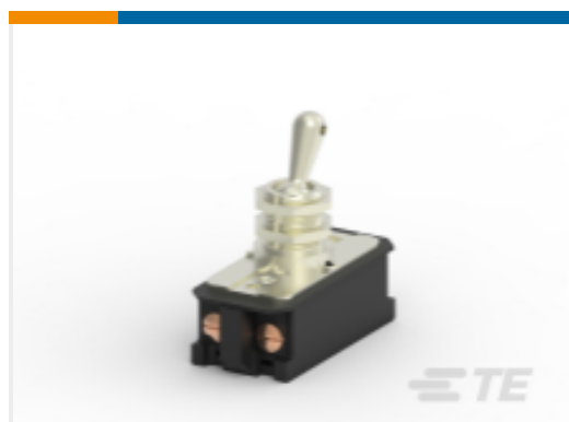
TE Part #1520237-2 7320K3=8 AMP TOGGLE SWITCH