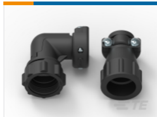
TE Part #1546349-2 CPC CABLE CLAMPS