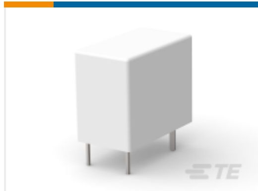
TE Part #1461404-6 STD OEG Miniature PCB OJ/OJE Pow Relays