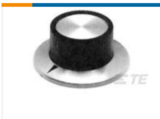
TE Part #1437625-5 PKS90B1/4=KNOB PLASTIC W/SKIRT