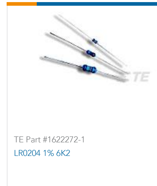
TE Part #1622272-1 LR0204 1% 6K2