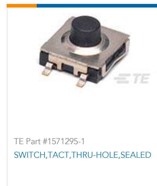
TE Part #1571295-1 SWITCH,TACT,THRU-HOLE,SEALED