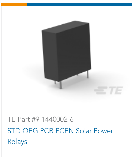
TE Part #9-1440002-6 STD OEG PCB PCFN Solar Power Relays