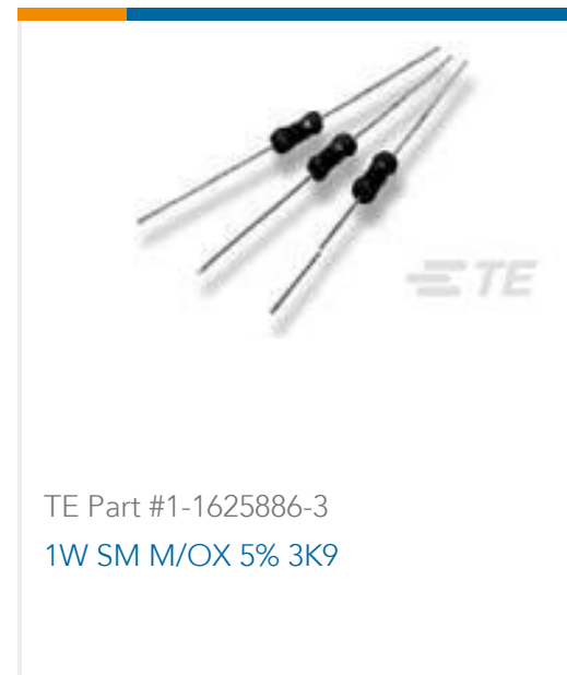
TE Part #1-1625886-3 1W SM M/OX 5% 3K9