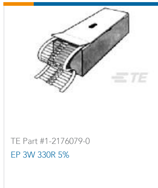
TE Part #1-2176079-0 EP 3W 330R 5%