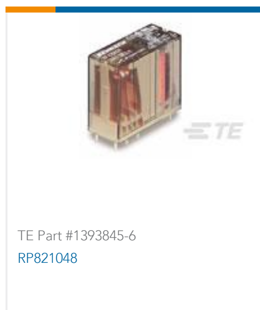
TE Part #1393845-6 RP821048