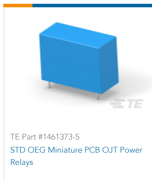
TE Part #1461373-5 STD OEG Miniature PCB OJT Power Relays