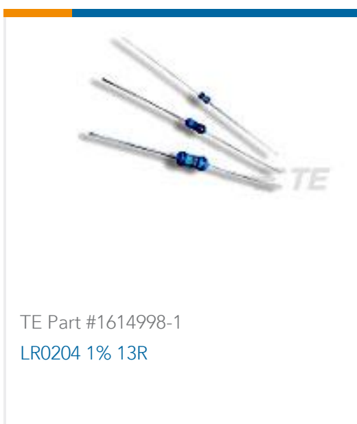
TE Part #1614998-1 LR0204 1% 13R