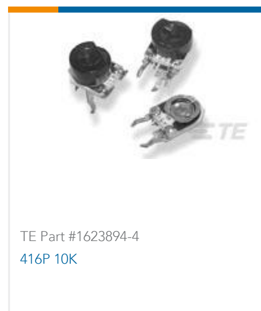
TE Part #1623894-4 416P 10K