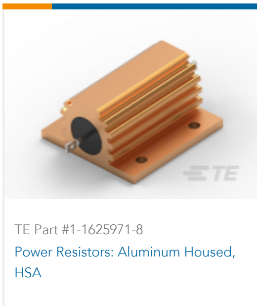
TE Part #1-1625971-8 Power Resistors: Aluminum Housed, HSA