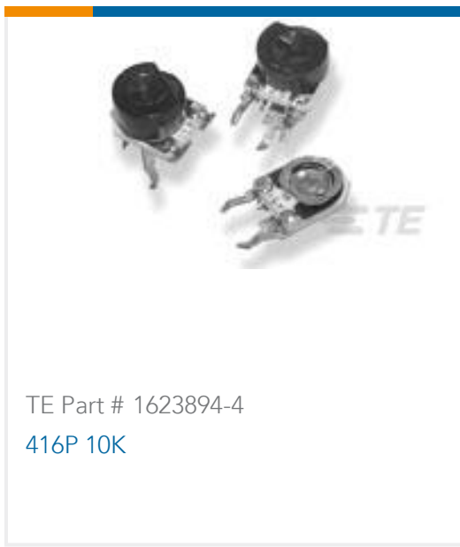
TE Part # 1623894-4 416P 10K