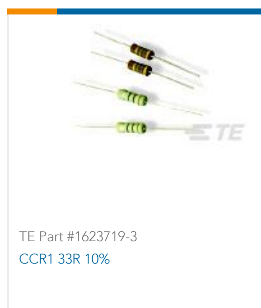
TE Part #1623719-3 CCR1 33R 10%