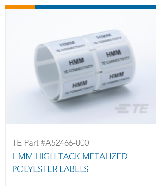
TE Part #A52466-000 HMM HIGH TACK METALIZED POLYESTER LABELS