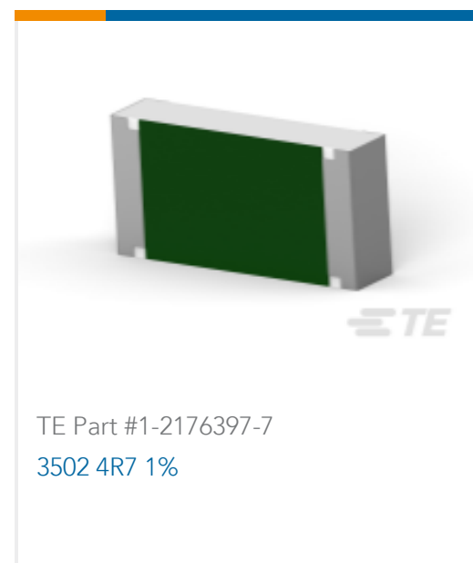
TE Part #1-2176397-7 3502 4R7 1%