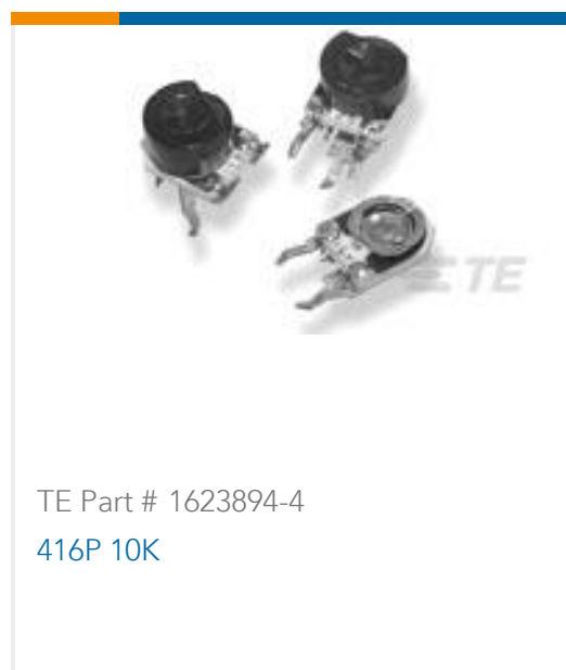
TE Part # 1623894-4 416P 10K