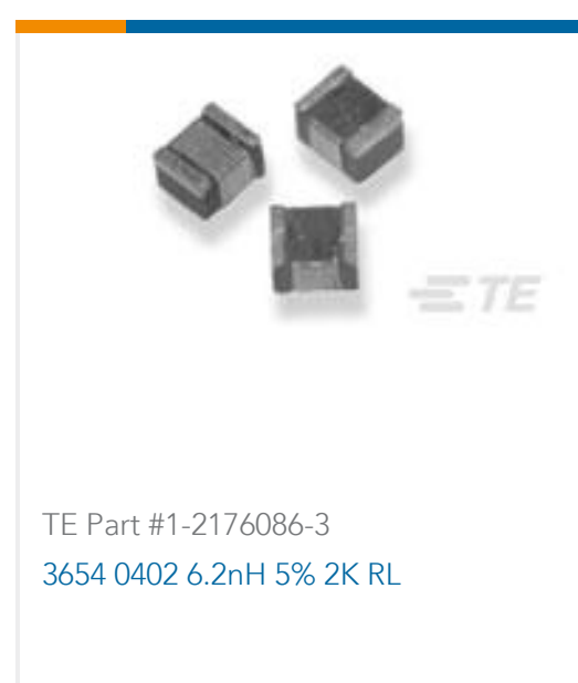
TE Part #1-2176086-3 3654 0402 6.2nH 5% 2K RL