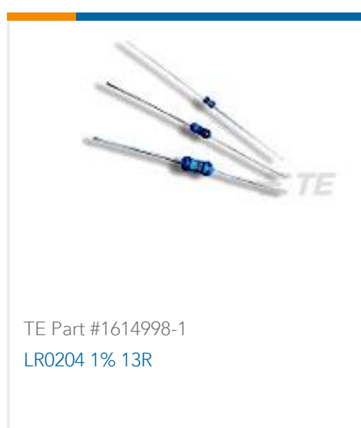
TE Part #1614998-1 LR0204 1% 13R