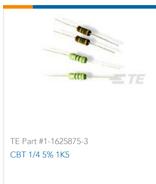
TE Part #1-1625875-3 CBT 1/4 5% 1K5