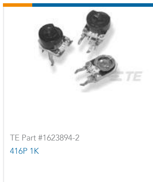
TE Part #1623894-2 416P 1K