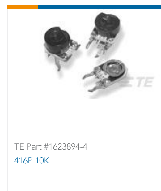
TE Part #1623894-4 416P 10K