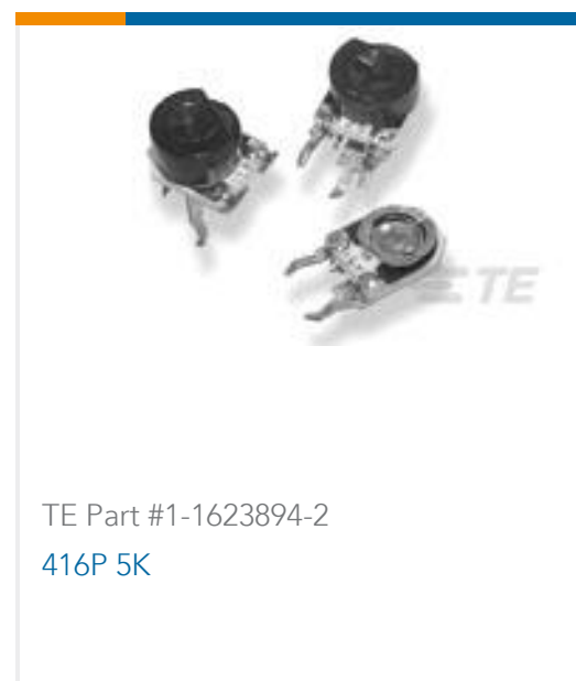
TE Part #1-1623894-2 416P 5K