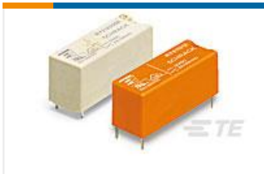
TE Part #2-1393225-3 RY612005