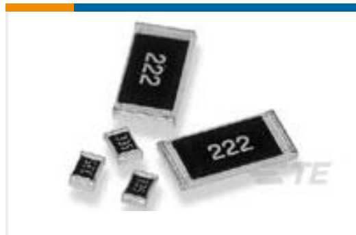
TE Part #1623256-1 CRG0805 1% 56R