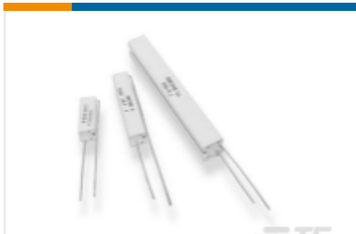
TE Part #2-1623730-2 Wirewound Resistor: Vertical Mount