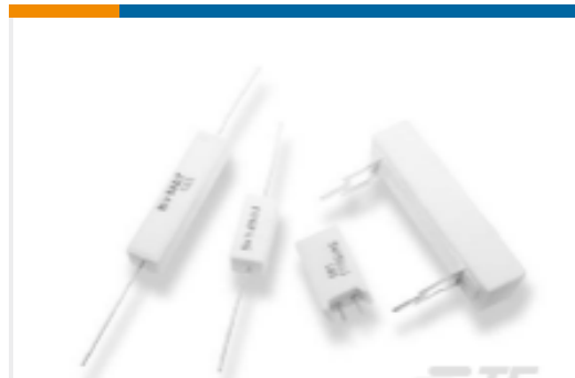
TE Part #1623783-7 Wirewound Resistor: Vertical Mount