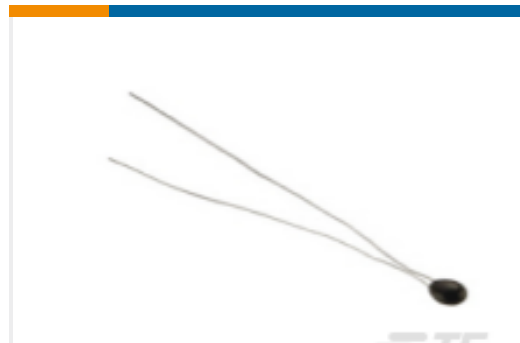
TE Part #GA100K6A1B DISCRETE NTC SERIES I