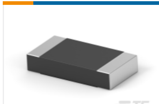
TE Part #1625827-8 Metal Chip Resistor: Current Sense