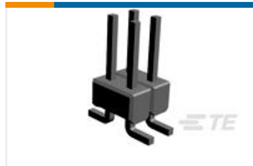
TE Part #1241050-2 2x2P MOD II BREAK AWAY HDR,SMD, BLISTER