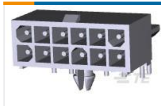
TE Part #1-770972-0 12P MINI UMNL R/A HDR ASSY LF