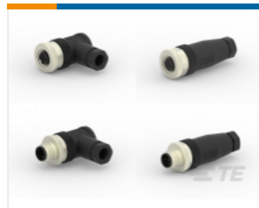
TE Part #T4111002081-000 M12 Field Installable Unshielded