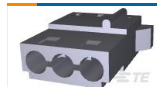
TE Part #1-480388-0 03P CMNL PLUG HSG F/H BLK