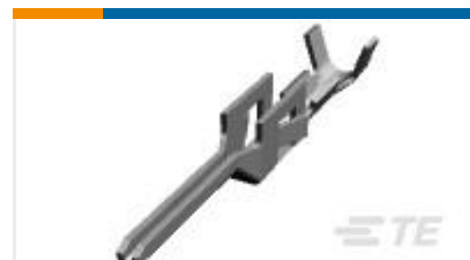
TE Part #1-794613-0 PIN CONT 26-30 TIN PLATE L/P