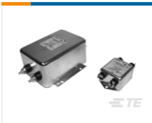
TE Part #1-6609037-3 CORCOM EMC SERIES SINGLE PHASE FILTERS