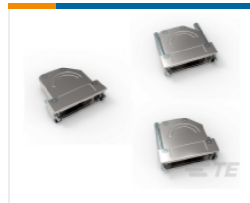
TE Part #1-2308342-6 D-SUB BACKSHELL SIZE 3