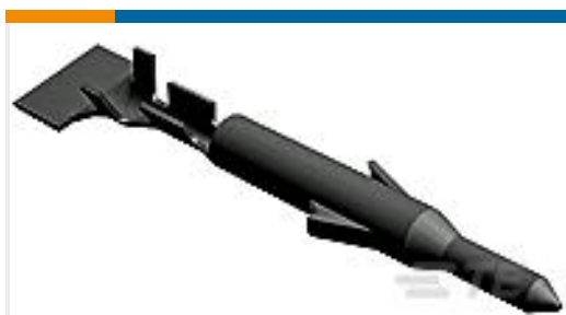
TE Part #1-794059-0 MINI UMNL PIN L/P LF