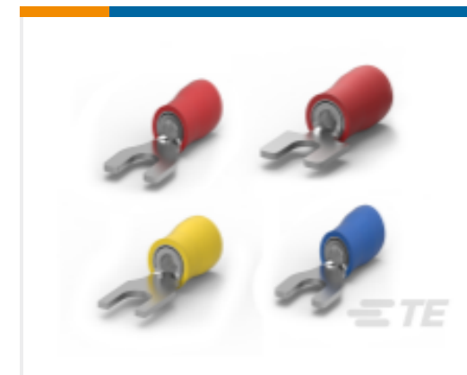
TE Part #1-327717-2 PIDG SPADE TONGUE TERMINALS