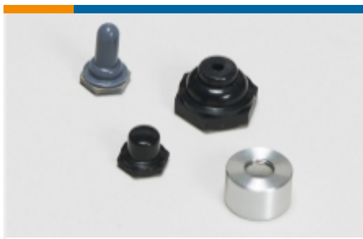
Switch Boots &amp; Accessories(15)