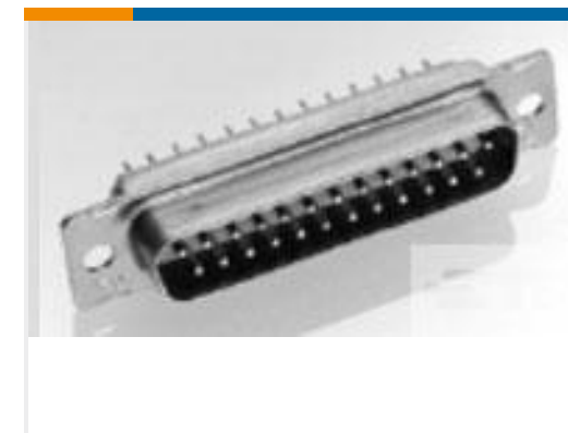
TE Part #1757820-7 AMPLIMITE,ASY,RCPT,STD,109,ZN,2,CT