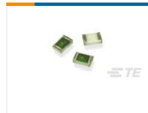
TE Part #1676279-2 RN 0805 294R 0.1% 10PPM 1KRL