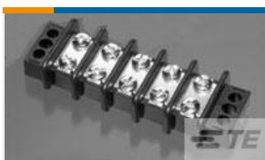
TE Part #1546671-2 2P .437" DR BARRIER,W/WIR CLMP