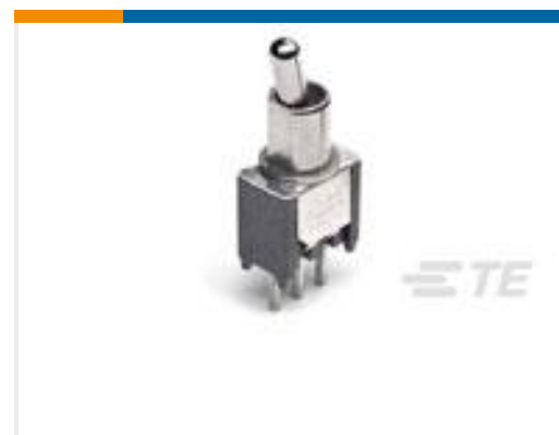
TE Part #1825222-3 TT13D2T04