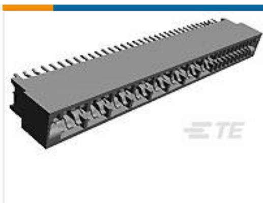
TE Part #1761500-1 CONNECTOR ASSEMBLY, SEC II POWER