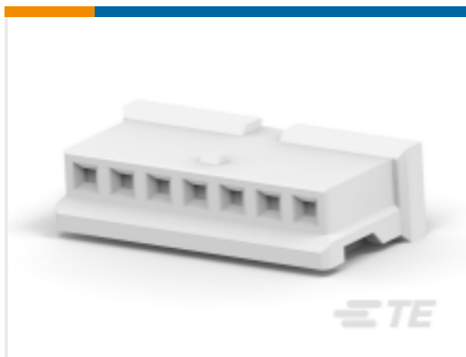
TE Part #1775441-2 AMP HPI 1.5MM RECEPTACLE HOUSINGS