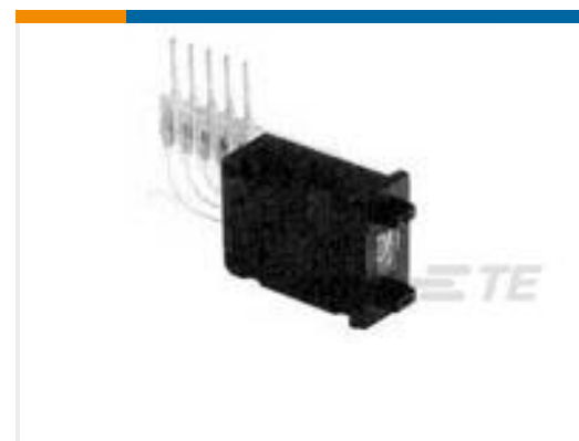
TE Part #1-1437601-8 PICOD137AK2=BCD COMPLEMENT SW