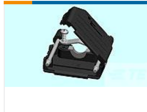
TE Part #1-1991253-5 15 WAY LOW COST D SUB BACKSHEL