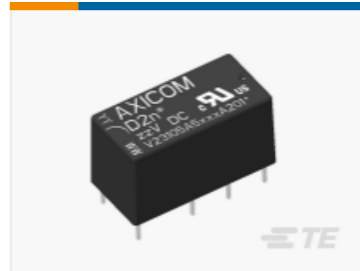
TE Part #1-1393793-4 AXICOM D2N SENSITIVE