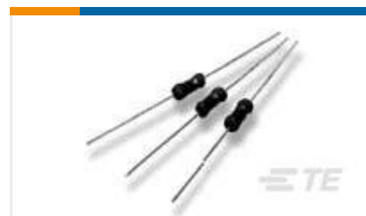
TE Part #1-1625892-2 3W SM M/OX 5% 12K