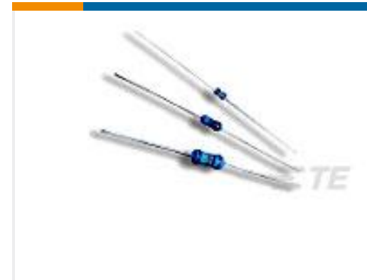
TE Part #1622352-1 LR1 1% 1K2