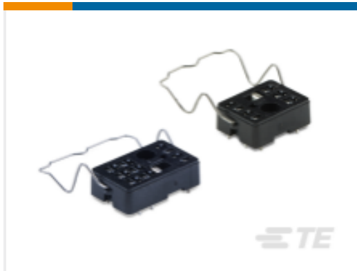
TE Part #1-1393824-0 CRADLE RELAY ACCESSORY