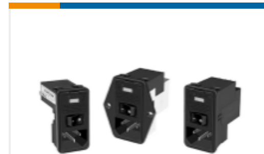
TE Part #1-6609104-5 CORCOM P SERIES MULTI- FUNCTION INLET FIL