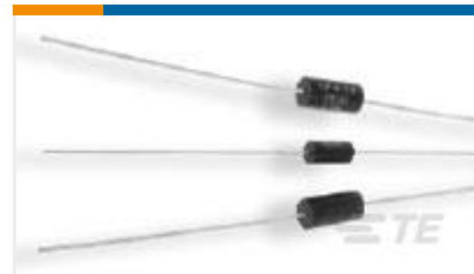
TE Part #1-1624323-5 UPW50 0.1% 5PPM 50K