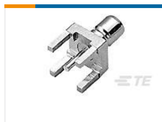
TE Part #1-1337482-0 SMB Str PCB Skt 50Ohm Gold Plt