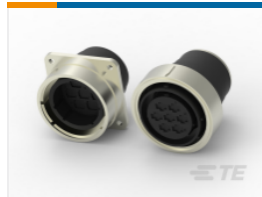
TE Part #208494-3 CMC SERIES 3