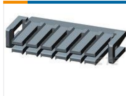
TE Part #2-1969541-4 RETAINER, TPA, DUAL ROW, EP2.5