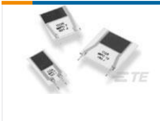
TE Part #1623776-6 MPC5 1R0 5%