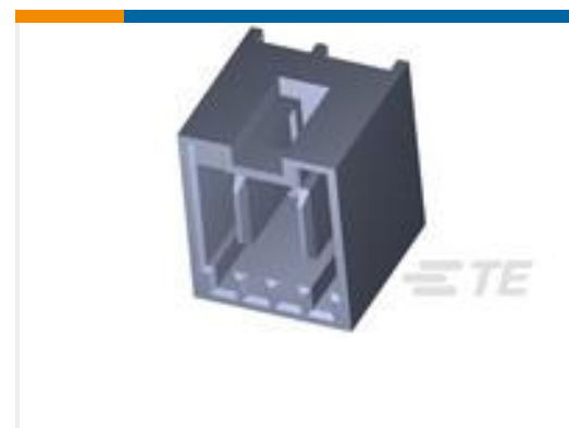
TE Part #1-1971846-2 2P, RAST 5 Tab Header, THV