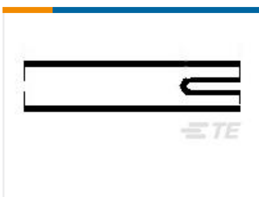
TE Part #CX4639-000 302A821-4/180-0