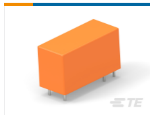
TE Part #2-1649329-8 RT444005