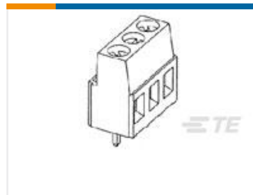
TE Part #1-796683-6 TERMI-BLOK PCB MOUNT 90 16P.