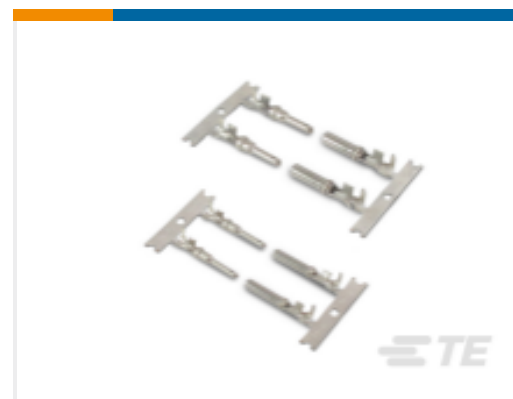
TE Part #1062-20-0222 DEUTSCH STAMPED & FORMED CONTACTS