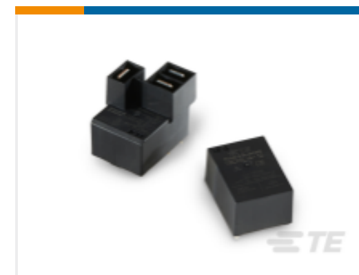
TE Part #1558660-4 PCB Power Relay: 30 amp, Monostable DC