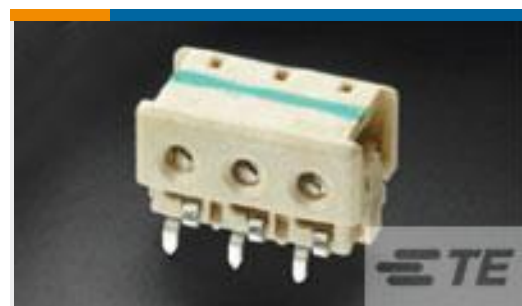
TE Part #1-2106751-4 Connector, Thru Hole-IDC, 4 pos, 20AWG