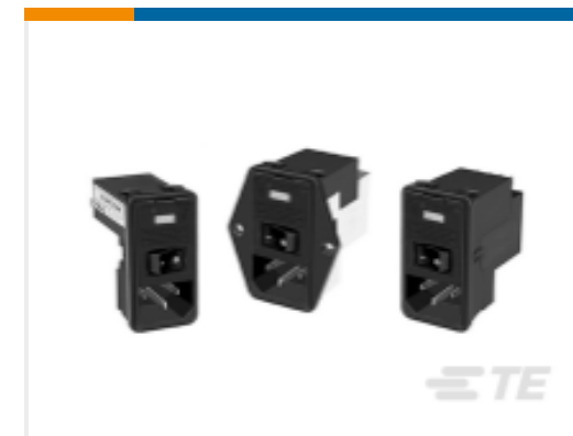
TE Part #1-6609104-3 CORCOM P SERIES MULTI-FUNCTION INLET FIL