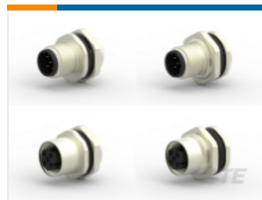
TE Part #T4130012051-000 M12 Panel Mount Solder Cups