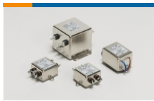
Single Phase Filters(13)