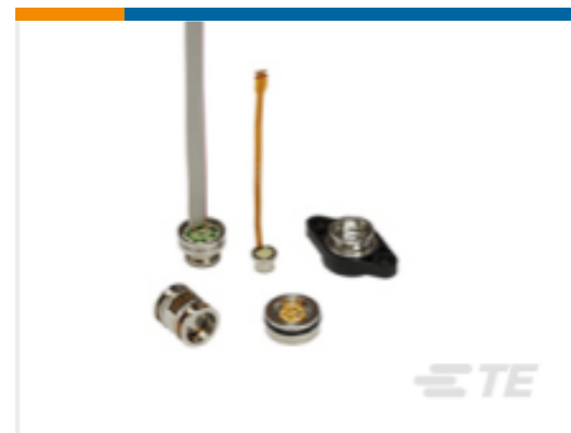
TE Part #154N-005G-RT MEDIA ISOLATED PRESSURE STOCK LIST