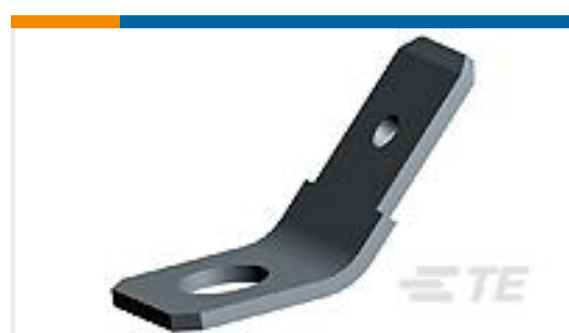
TE Part #140598 250 FASTON, TAB, TPBR