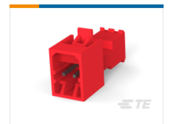
TE Part #647000-3 Nylon Tin Plated Plug: 2.54mm, With Mating Alignment, MTA 100