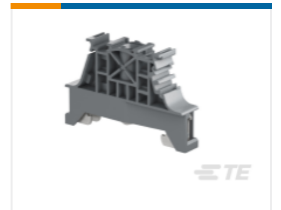
TE Part #1SNK900001R0000 BAM4