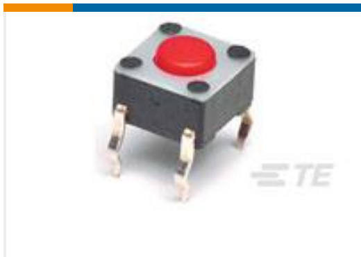
TE Part #1825910-6 FSM4JH=6MM TACT SWITCH, HIGH TEMP