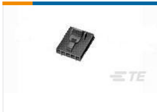
TE Part #104257-8 09 MTE RCPT HSG SR LATCH .100