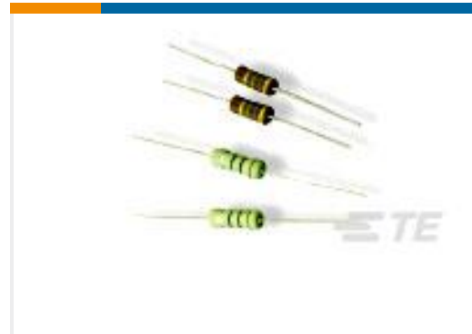
TE Part #2-1625876-9 CBT 1/2 5% 100R