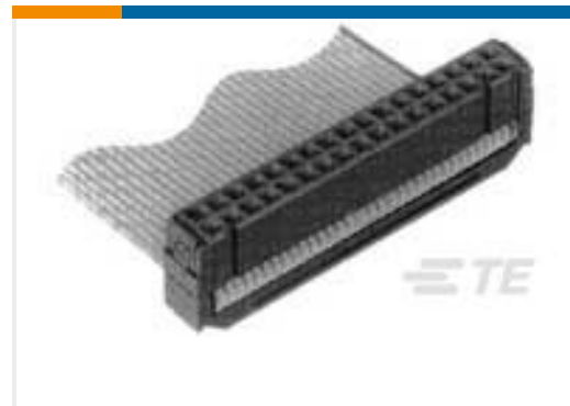
TE Part #1658623-4 20 NOVO MIL 30DP, LEAD FREE