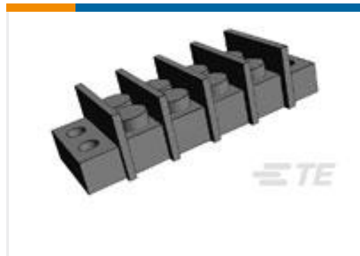
TE Part #1546306-4 4P .374" DR BARRIER STRIP