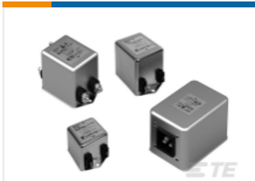
TE Part #2-1609037-9 CORCOM HZ SERIES SINGLE PHASE FILTERS