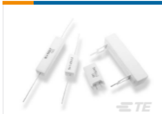
TE Part #1-1623779-6 Wirewound Resistor: Vertical Mount