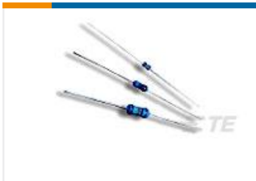
TE Part #1622298-1 LR1 1% 10K