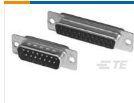
TE Part #5-747904-5 9 Plug Solder Cup, 30 gold, Ro