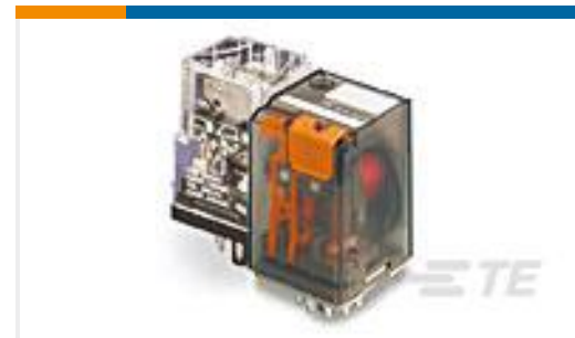
TE Part #3-1393104-3 KRPA-11AN-24=KRPA