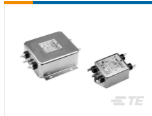
TE Part #1609042-6 CORCOM S SERIES SINGLE PHASE FILTERS