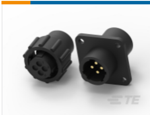
TE Part #206151-1 CPC SERIES 1