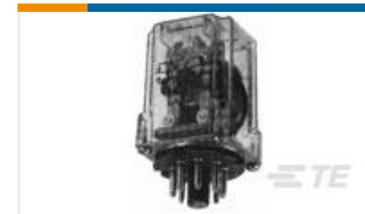
TE Part #7-1393101-9 KRP-11AG-240=KA/KB/KC/KR