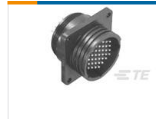
TE Part #1-206934-1 CPC RECPT ASSEMBLY SIZE 23-37