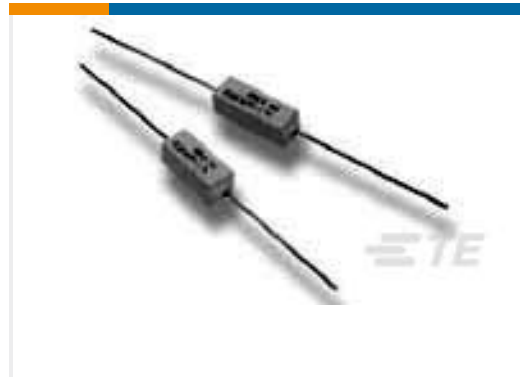
TE Part #1-1623819-4 SBL4 R051 5%