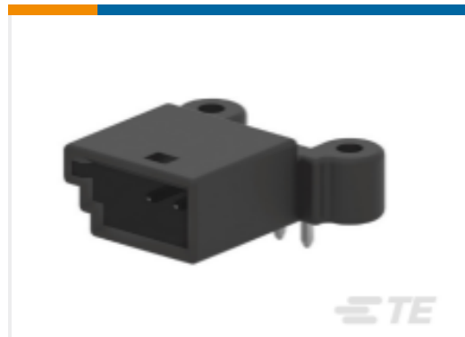
TE Part #1-174954-1 SIGNAL HEADER