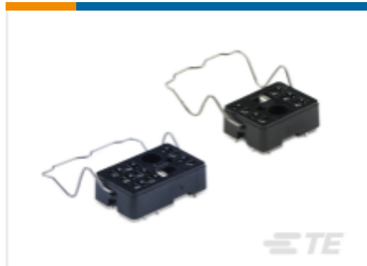
TE Part #1393827-2 CRADLE RELAY ACCESSORY