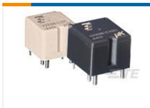
TE Part #1393280-6 V23086C1001A403