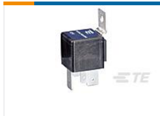
TE Part #1-1393304-1 V23134J1053D642-EV-CBOX