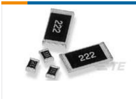
TE Part #1623463-1 CRG1206 1% 22R