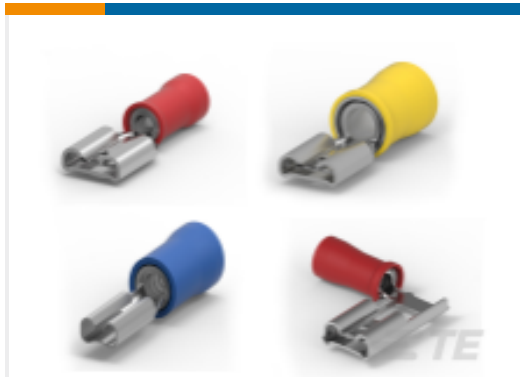
TE Part #156667-1 PIDG FASTON RECPT QUICK DISCONNECTS