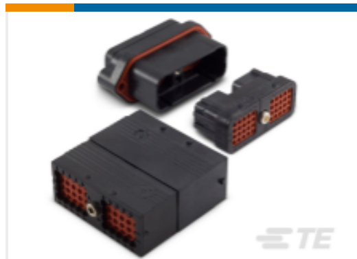
TE Part #DRC16-24SA-P013 DEUTSCH DRC HOUSINGS