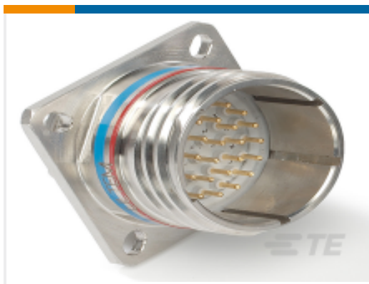
TE Part #YDTS20F25-37SEV001 D38999: Square Flange, 25-37 insert