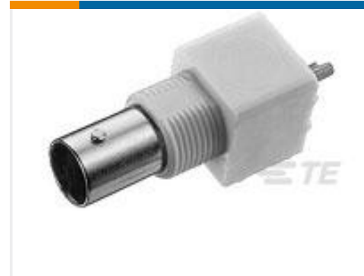
TE Part #5415632-2 VERTICAL BNC PCB JACK