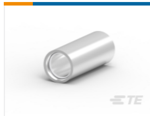
TE Part #1958510-1 SPLICE,STRATO-THERM, BUTT, HR, 2 AWG