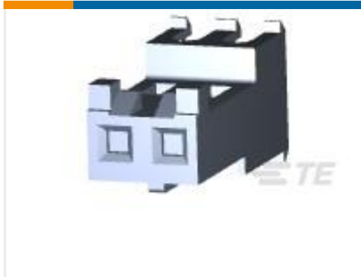
TE Part #3-647479-2 02P MTA156 CONN ASSY 18AWG ORA