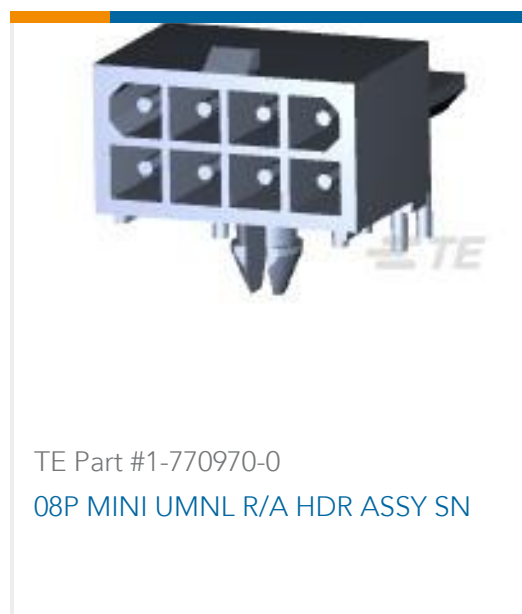
TE Part #1-770970-0 08P MINI UMNL R/A HDR ASSY SN