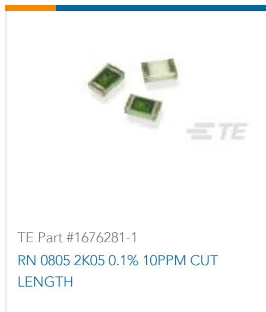
TE Part #1676281-1 RN 0805 2K05 0.1% 10PPM CUT LENGTH