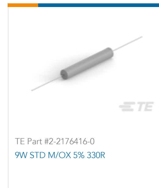
TE Part #2-2176416-0 9W STD M/OX 5% 330R