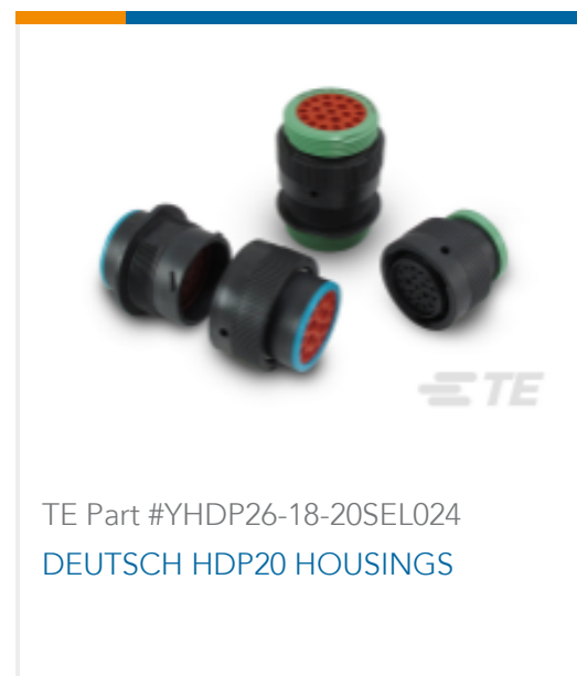
TE Part #YHDP26-18-20SEL024 DEUTSCH HDP20 HOUSINGS