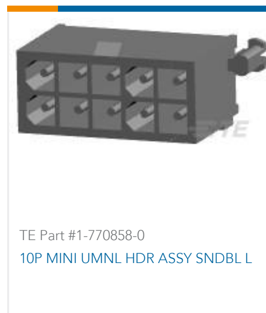
TE Part #1-770858-0 10P MINI UMNL HDR ASSY SNDBL L