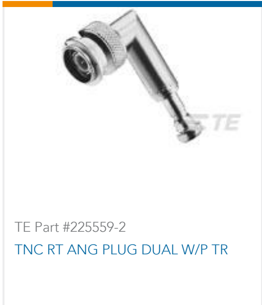
TE Part #225559-2 TNC RT ANG PLUG DUAL W/P TR