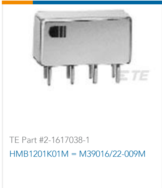
TE Part #2-1617038-1 HMB1201K01M = M39016/22-009M