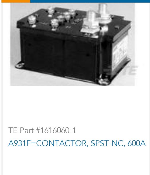
TE Part #1616060-1 A931F=CONTACTOR, SPST-NC, 600A