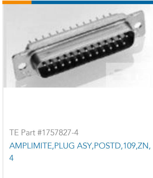
TE Part #1757827-4 AMPLIMITE, PLUG ASY, POSTD, 109, ZN, 4