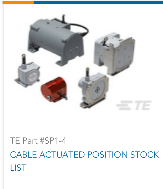
TE Part #SP1-4 CABLE ACTUATED POSITION STOCK LIST