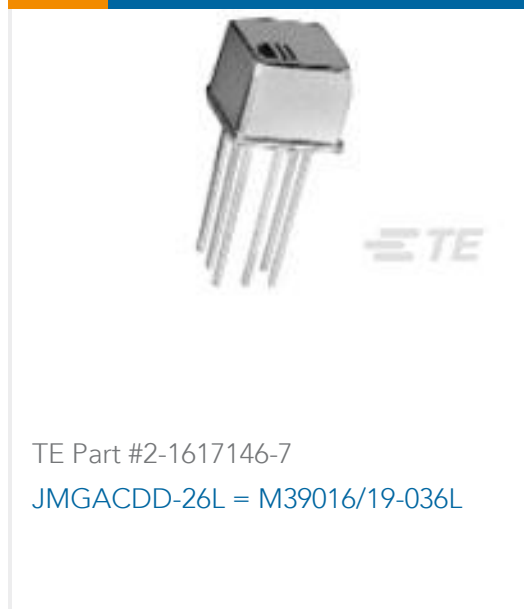
TE Part #2-1617146-7 JMGACDD-26L = M39016/19-036L