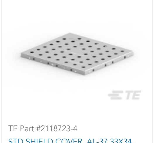
STD SHIELD COVER, AL-37.33X34. 18X2.00MM